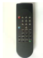
Remote handset (with batteries)