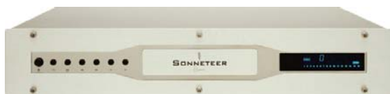
CD Player (with mains cable)